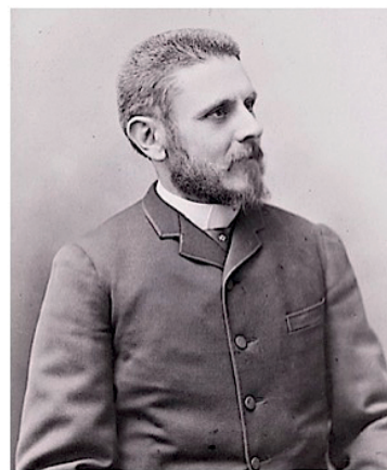
Figure 1. Doctor Pierre Marie, 1889.

As the only child of a wealthy family, Marie received excellent classical education, becoming fluent in Latin and Greek. He entered the Paris School of Medicine after fulfilling his father's wish — a law degree 3,4,5 . His strong and authoritarian traits contrasted with his average height. The square-cut gray